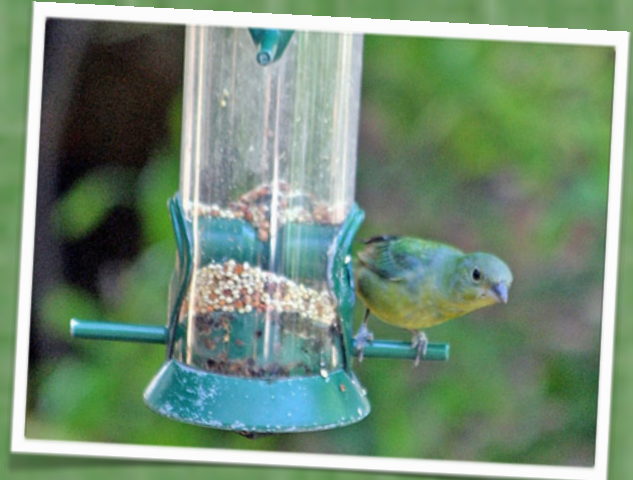
Female or Juvenile